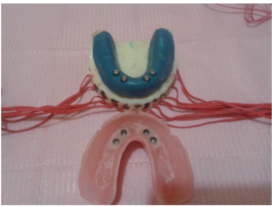
(Fig 1) four implants inserted in the model, two in the canine region and two in the premolar region.