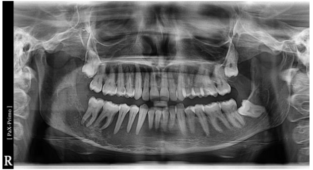
Figure 2. Orthopantomograph showing presence of ill-defined osteolytic destructive lesion related to lower teeth on the right side.

The patient was referred to medical oncology department to provide the necessary management. Regarding medical management of this patient, immunosuppressive agents including steroid discontinued and then referred to gynaecologist to take biopsy from genital growth to exclude the presence of another potential tumour. Moreover, due to lack of oncological guidelines in the management of such a patient, and the peculiarities of the oral lesion, the patient was referred to radiotherapy department. Additionally, there was also the concern and challenge that; stoppage of immunosuppressive therapy may result in worsening of GvHD with multisystem involvement.